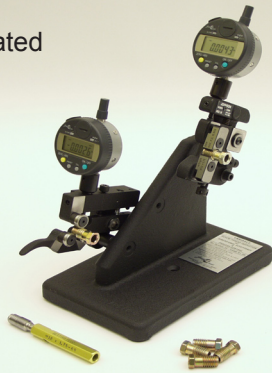
Series CX/BX-ER External Adjustable Extended Range