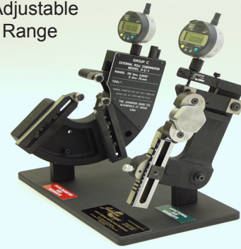
Series CX/CX External Adjustable